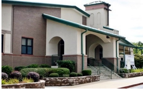
St. Joseph Catholic Church - Fayetteville

DATE, TIME & PLACE OF SERVICE Thursday, April 25, 2013 - 10:30 A.M.